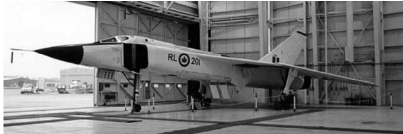
Figure A-4 CF-105 Avro Arrow

The Avro Arrow was developed and proved to be an outstanding aircraft, ahead of its time. Tests flights were started in 1958 by chief test pilot Jan Zurakowski. At the same time, the Astra fire-control and Sparrow missile program were experiencing major developmental problems and creating major cost overruns. The overall costs for the Arrow project were several million dollars and increasing.