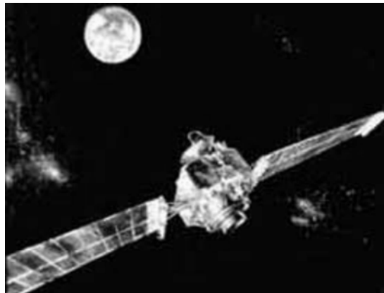
Figure A-6 Hermes Spacecraft

Hermes was the first high powered satellite in orbit which led to present day satellites used to broadcast television directly to individual homes using small low-tech satellite dish antennas.