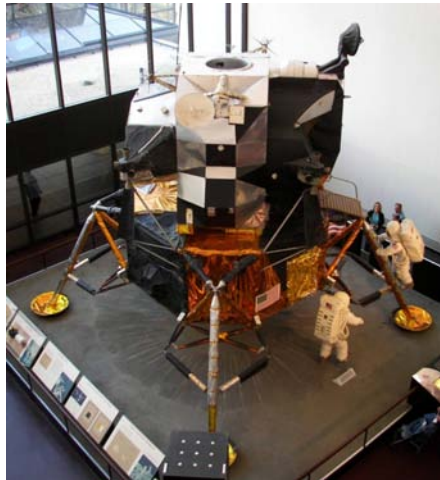
Figure A-5 Lunar Module (LM-2)