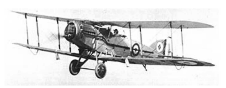
Figure 10A-1 A Sopwith Triplane

Aces and Aircraft of World War I, 2007, The Aerodrome. Bristol F.2B Fighter. Retrieved 20 March 2007, from http://www.theaerodrome.com/aircraft/gbritain/bristol_f2b.php