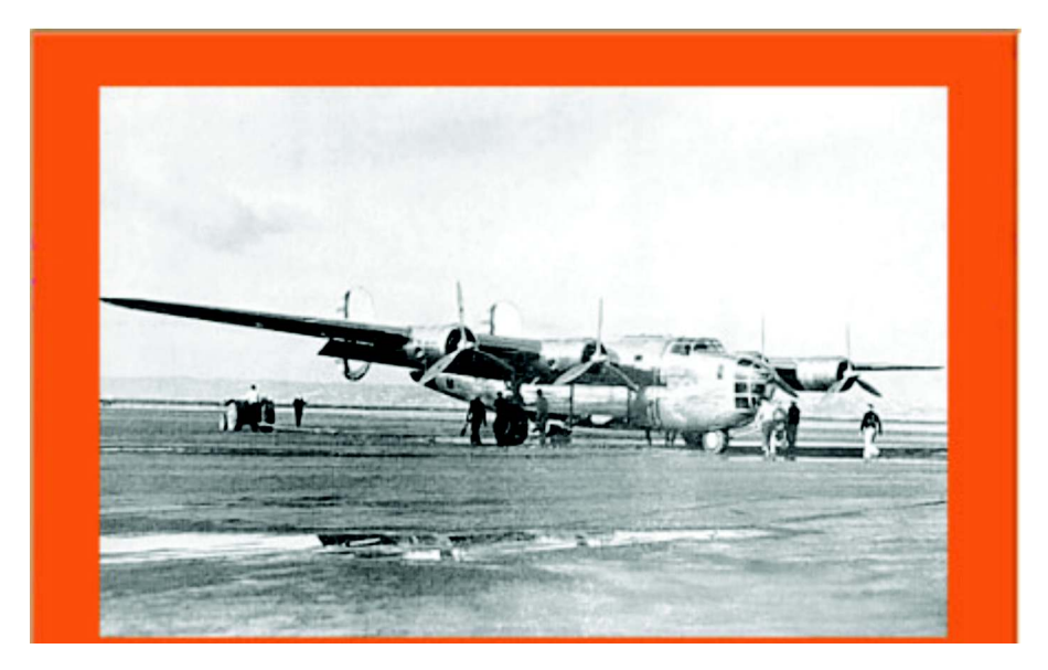
"Consolidated B-24 Liberator Bomber", Beehive Hockey Photos (2006). Retrieved 20 March 2007, from http://www.beehivehockey.com/photo_18liberator.htm