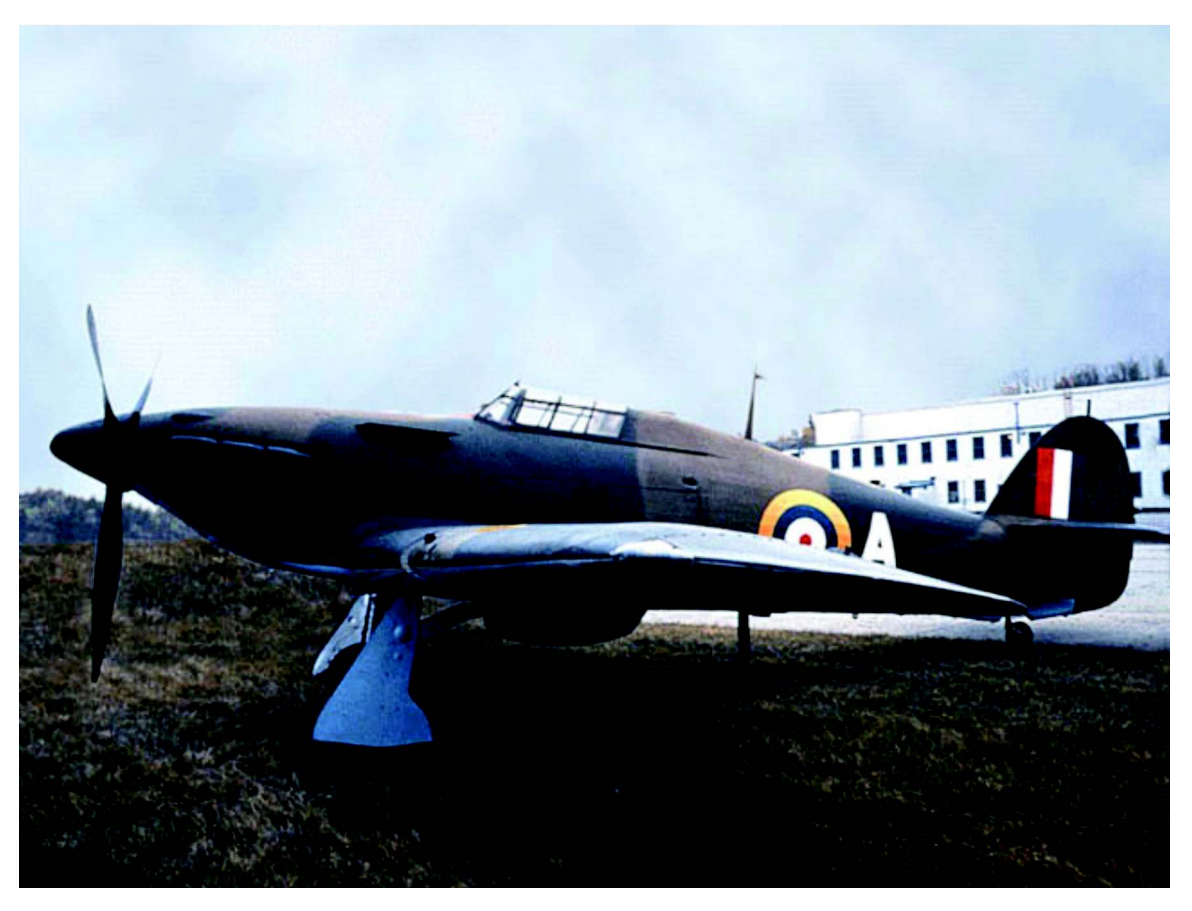
Department of National Defence. (2006). Canadian Forces Aircraft. Retrieved 20 March 2007, from http://www.airforce.forces.gc.ca/equip/grfx/equip_gallery/historic_gallery/wallpaper/harvarda9.jpg