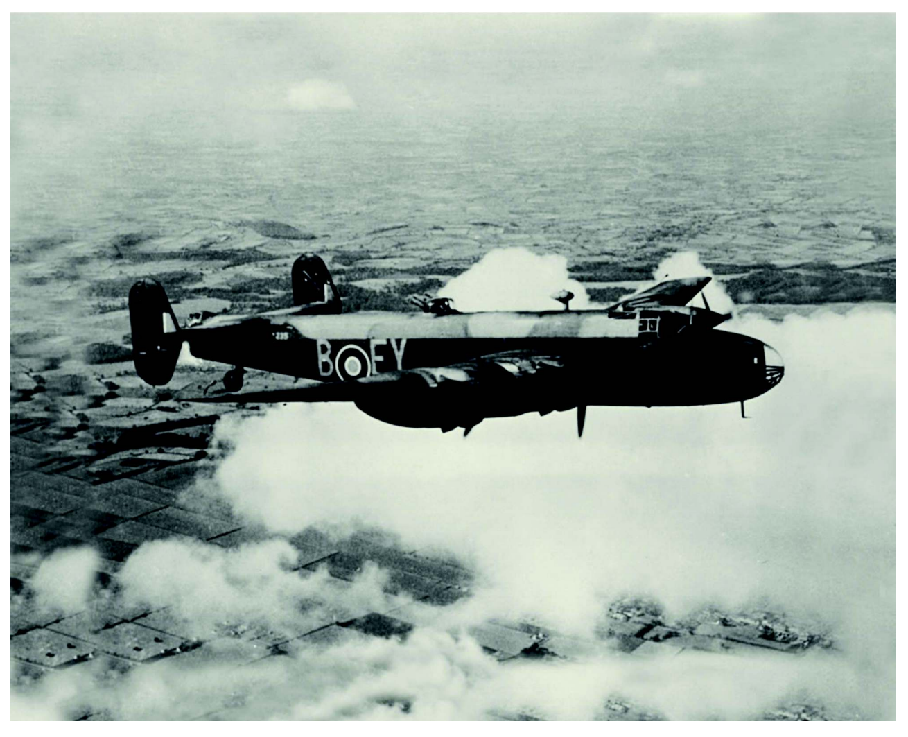
Department of National Defence. (2004). Canadian Forces Historical Aircraft. Retrieved 22 March 2007, from http://www.airforce.forces.gc.ca/equip/historical/Halifax_e.asp