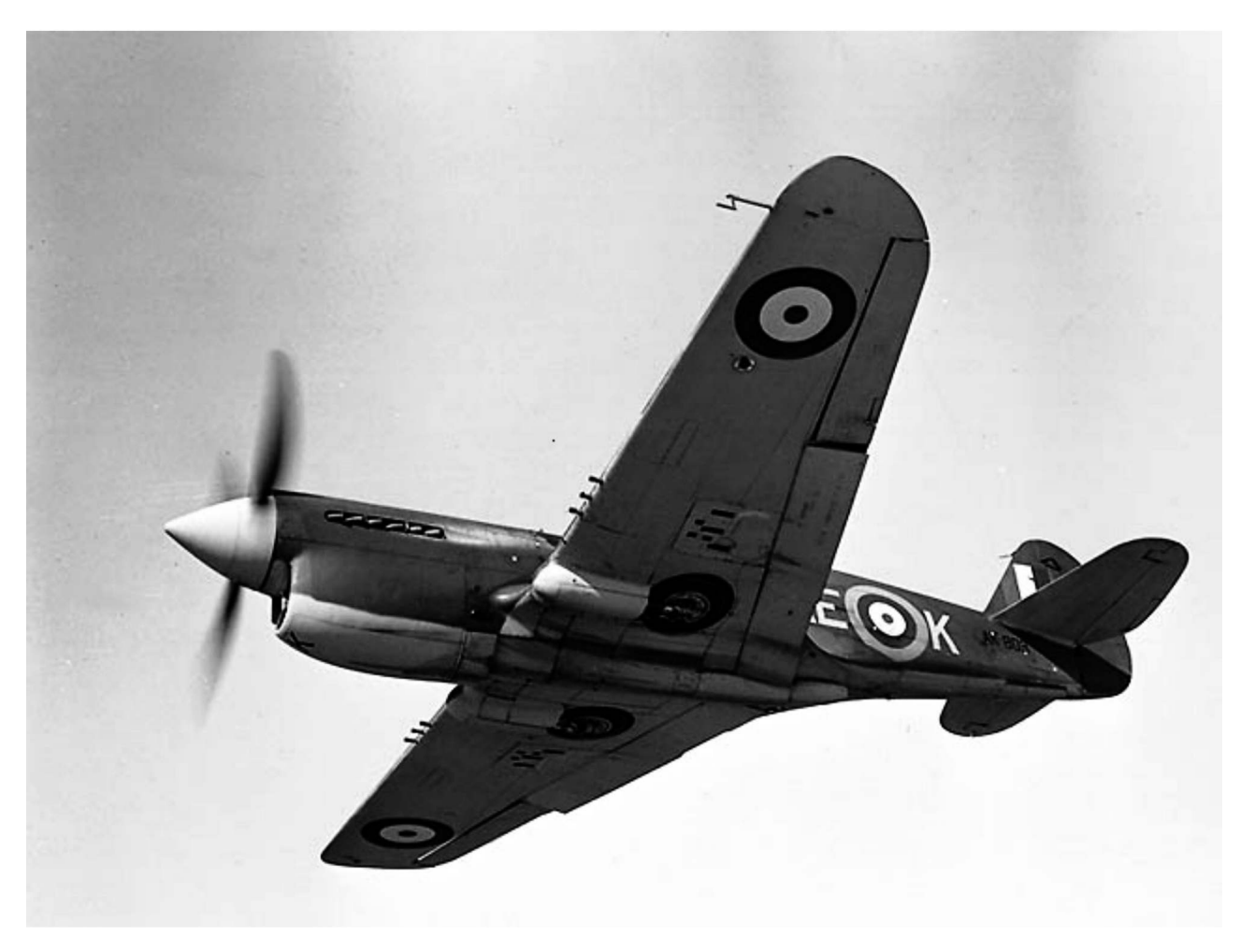
Department of National Defence. (2006). Canadian Forces Aircraft. Retrieved 20 March 2007, from http://www.airforce.forces.gc.ca/equip/grfx/equip_gallery/historic_gallery/wallpaper/harvarda9.jpg