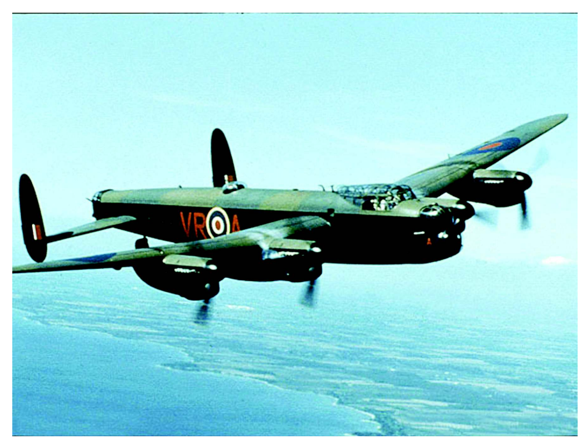
Department of National Defence. (2006). Canadian Forces Aircraft. Retrieved 22 March 2007, from http://www.airforce.forces.gc.ca/equip/grfx/equip_gallery/historic_gallery/wallpaper/lanc.jpg