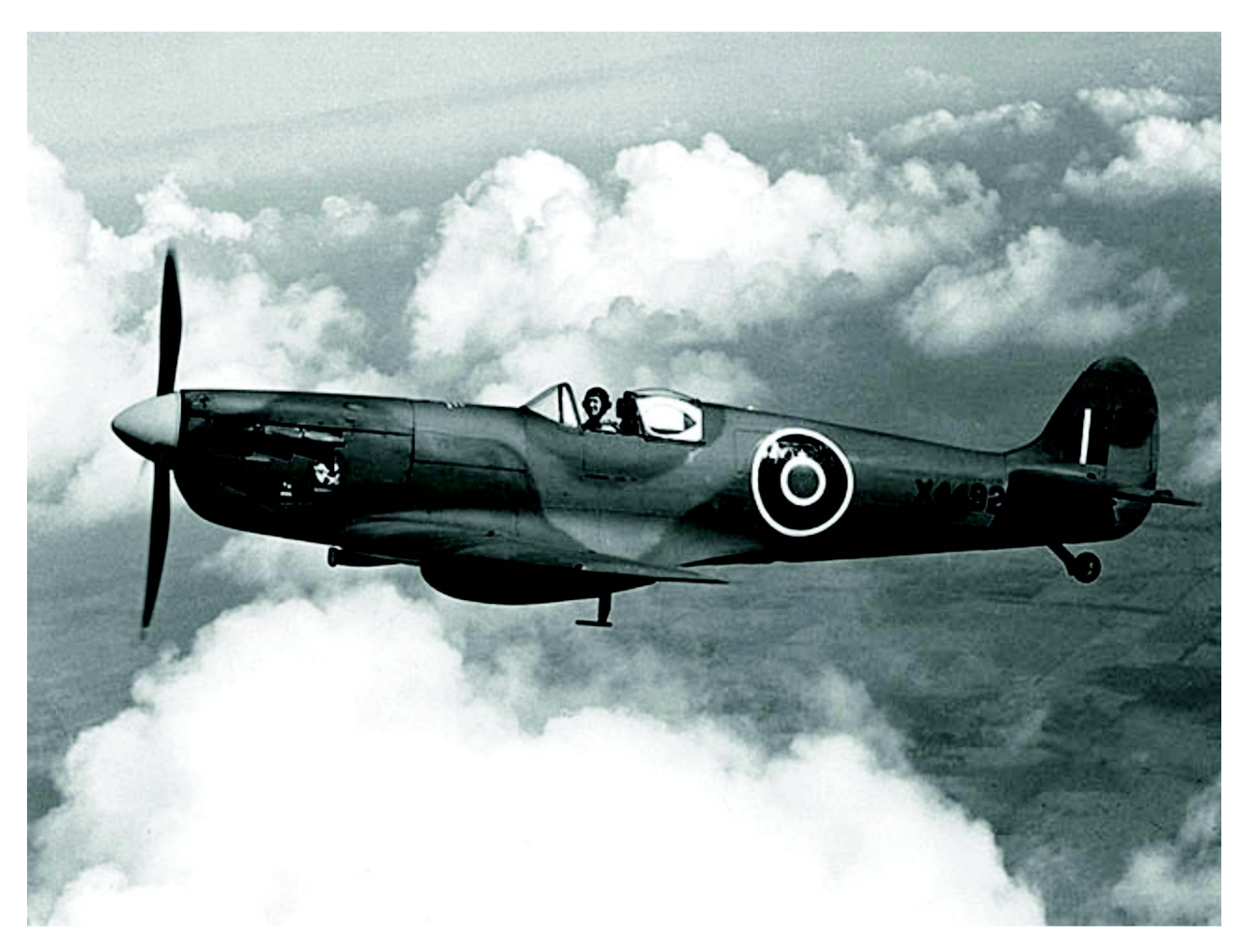
Department of National Defence. (2006). Canadian Forces Aircraft. Retrieved 20 March 2007, from http://www.airforce.forces.gc.ca/equip/historical/spitfirelst_e.asp