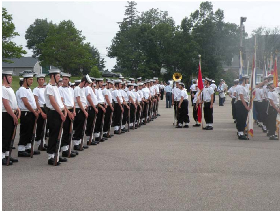
Figure A-9 CSTC Training

Each region selects CIC officers for CSTCs. A list of available positions is published in the fall and applications are sought from CIC officers interested in employment. During the winter, selection boards are held to sort through applications and decide which applicants are best suited for the various positions. In the spring, a list of those CIC officers selected for employment is published.