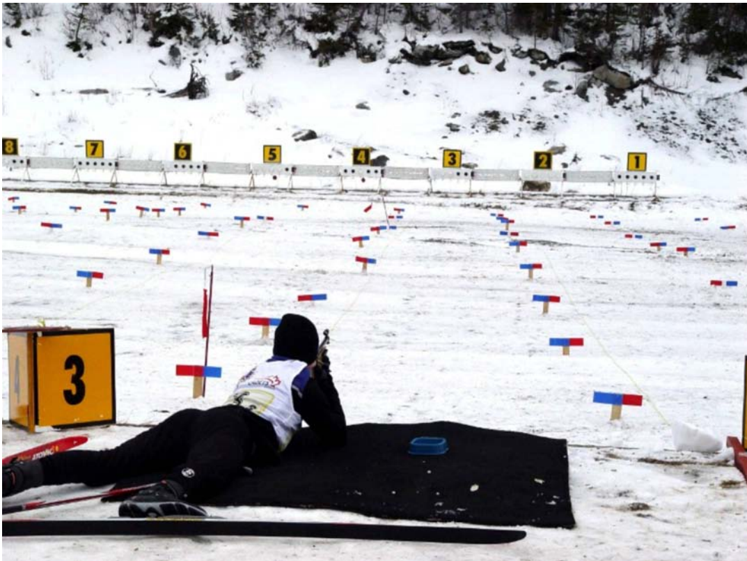
Figure A-7 Provincial Biathlon Championships

RDAs are activities that Regional Cadet Support Unit (RCSU) COs conduct annually within their regions. RDAs augment the corps / squadron program by maintaining the cadets' interest in specific areas of cadet training and allow RCSU COs to tailor the overall CP to match regional interests and capitalize on regional opportunities and resources. RDAs fall into two categories: non-discretionary and discretionary. Many RDAs require the support of corps / squadron officers to plan and implement and are hired on Class A service.