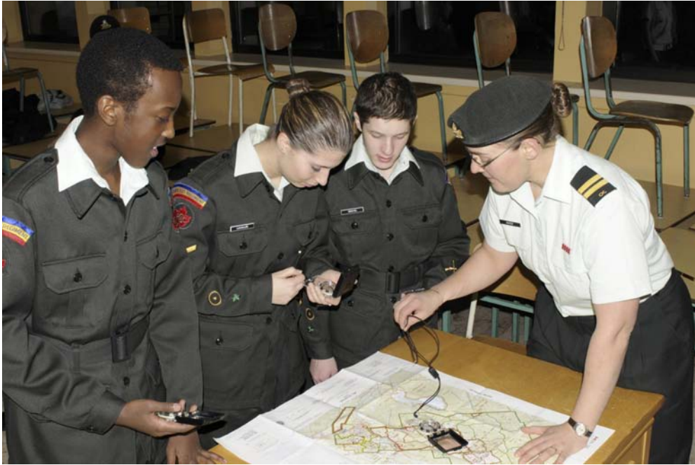
Figure A-3 CIC Corps / Squadron Officer

If a cadet corps / squadron has a vacancy on their establishment, a new CIC officer can be enrolled and fill one of these positions. If no position exists, the new CIC officer may be enrolled and fill a position on a regional / detachment holding list and volunteer with the cadet corps / squadron.