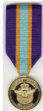
Figure A-3 ACLC Air Cadet Service Medal

ACLC Air Cadet Service Medal. This award recognizes continuous cadet service of at least four years by deserving cadets. The award is in the form of a medal to be worn on the right breast of the uniform.