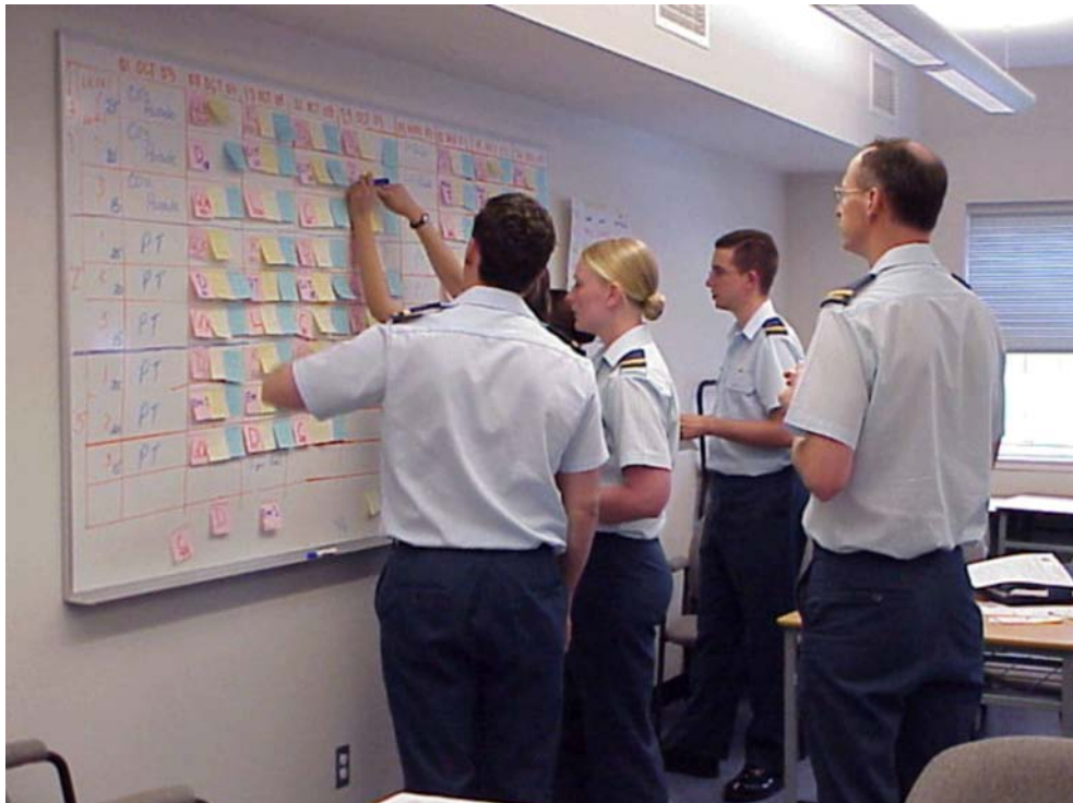
Figure A-8 RCIS Training

Each region, with the exception of Northern, has a school for the training of CIC officers: RCIS (A) for Atlantic region, RCIS (E) for Eastern region, etc. Although each school is organized slightly differently, there are many similar positions available to CIC officers. A commandant oversees all aspects of the school and performs full-time Class B service. At most RCISs, a Standards Officer and Administration Officer also perform full-time Class B service. To augment this core staff, CIC officers are hired for either part-time or full-time Class A or Class B service to act as Directing Staff (DS) for courses being conducted.