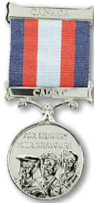
Figure A-2 Cadet Award for Bravery

Cadet Award for Bravery. Awarded by the Canadian Forces to cadets who perform outstanding deeds of valour which involve risking their own lives in saving the lives or property of others. The award is in the form of a medal to be worn on the left breast of the uniform. The CO initiates the recommendation, which is forwarded through all three levels of the ACLC where the Executive Committee forwards it to Canadian Cadet Movement National Honours and Awards Committee. Final approval is made by the Chief of Defence Staff (CDS).