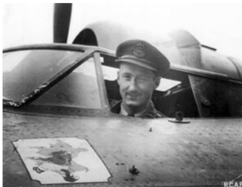
Figure A-9 Squadron Leader Birchall

Air Commodore (equivalent to Brigadier General) Birchall, Commandant of Royal Military College, Kingston, Ontario, retired from the RCAF in 1967. He passed away on September 10, 2004 at the age of 89.