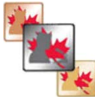
Figure A-7 Effective Speaking Competition Pins

Participants at each level are awarded a pin: bronze at the zone level, silver at the provincial / territorial level, and gold at the national level.