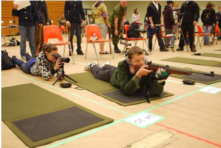
Figure A-10 National Marksmanship Championships

All CIC officers are eligible for employment on NDAs and are selected based on their knowledge and experience in the NDA's subject material.