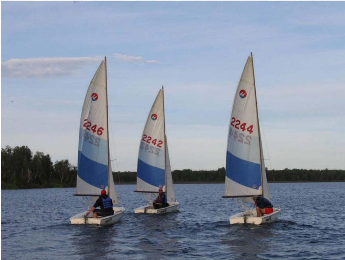
Figure A-4 Sail Centre Training