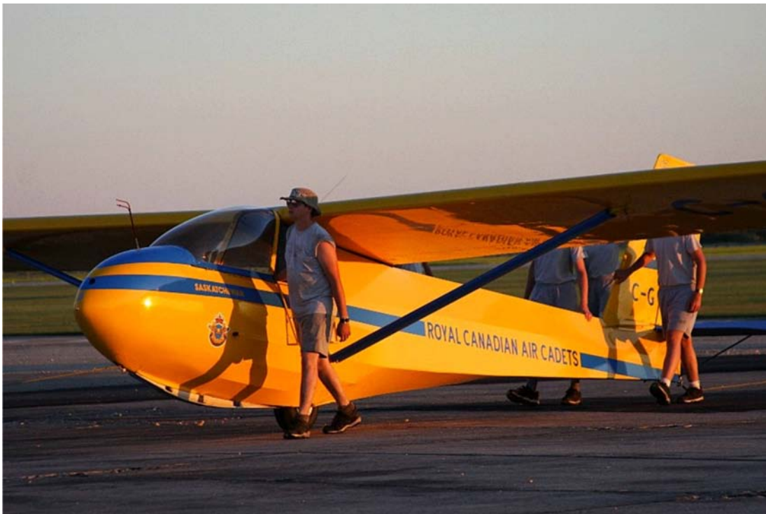
Figure A-6 Gliding Centre Training