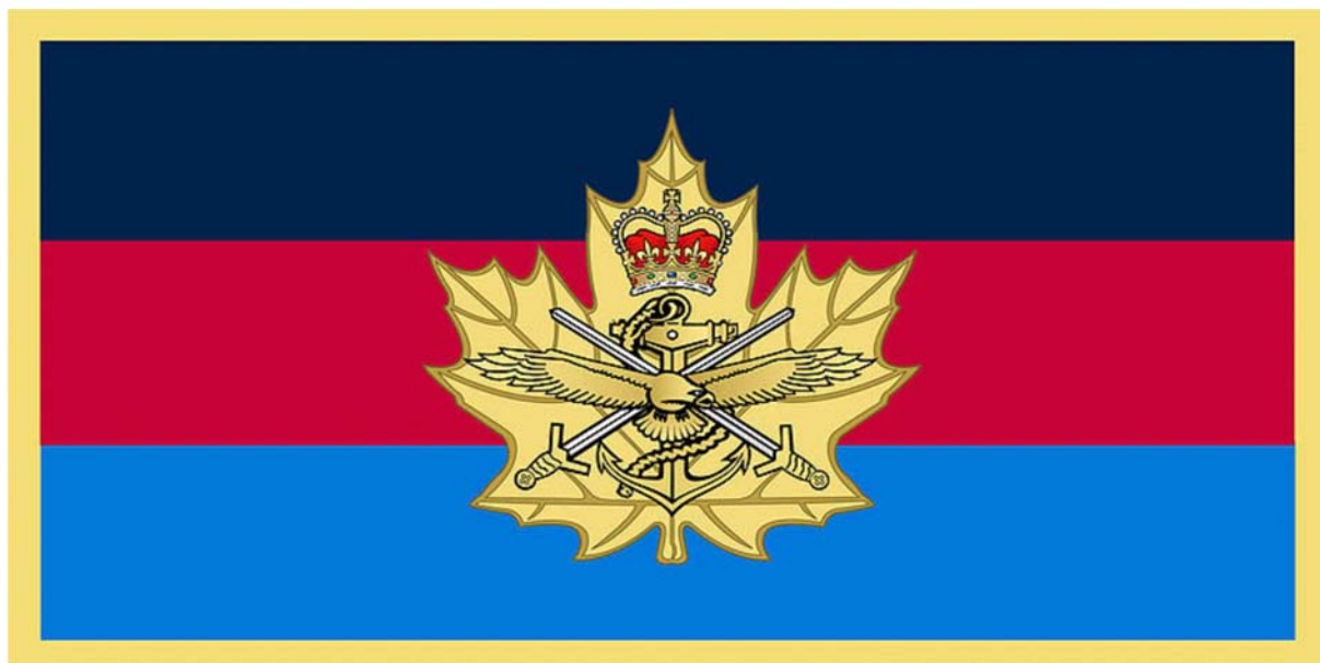
Figure A-1 CIC Branch Flag

The CIC is a Personnel Branch of the Canadian Forces (CF). It celebrated its 100th anniversary in 2009 making it one of the oldest components of the CF. Every member of the CF belongs to an occupation or trade and CIC officers are no exception. Each trade is assigned an identification code. The Cadet Instructors Cadre officers' MOSID is 00232-01 for naval elemental officers, 00232-02 for army elemental officers and 00232-03 for air elemental officers.