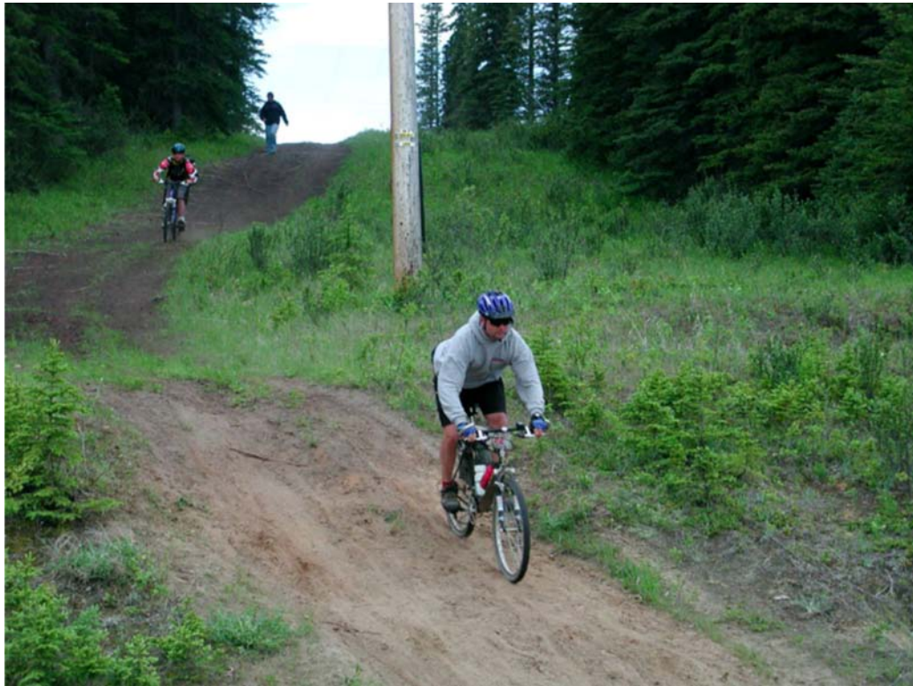
Figure A-5 Expedition Centre Training