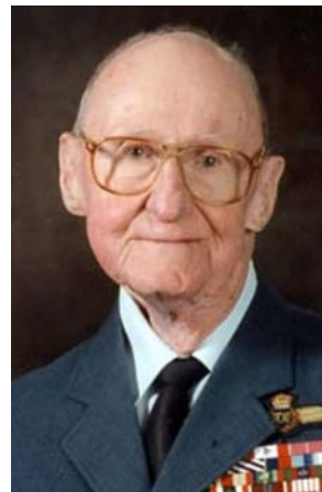
Figure A-10 Air Commodore Birchall