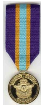
Figure A-3 ACLC Air Cadet Service Medal

ACLC Air Cadet Service Medal. This award recognizes continuous cadet service of at least four years by deserving cadets. The award is in the form of a medal to be worn on the right breast of the uniform.