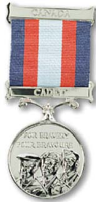
Figure A-2 Cadet Award for Bravery

Cadet Award for Bravery. Awarded by the Canadian Forces to cadets who perform outstanding deeds of valour which involve risking their own lives in saving the lives or property of others. The award is in the form of a medal to be worn on the left breast of the uniform. The CO initiates the recommendation, which is forwarded through all three levels of the ACLC where the Executive Committee forwards it to Canadian Cadet Movement National Honours and Awards Committee. Final approval is made by the Chief of Defence Staff (CDS).